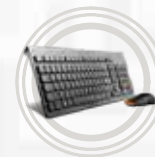
Lenovo Professional Wireless Combo