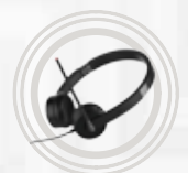
Lenovo Stereo Headset