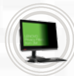
Lenovo Privacy Filter for ThinkCentre AIO from 3M