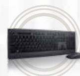
Lenovo Professional Wireless Keyboard & Mouse Combo