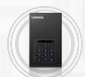
Lenovo Secure Desktop Hard Drive