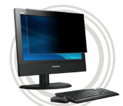
3M Monitor Privacy Filter Privacy Protection & Anti-Glare