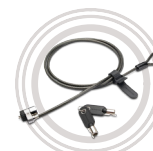
Kensington® Twin Head Cable Lock from Lenovo™ Ultra Protection Against Theft