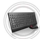
Lenovo™ Ultraslim Wireless Keyboard and Mouse Combo Fast & Fluid