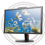
ThinkVision® T-series Multimedia, Full-Series