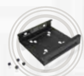
ThinkCentre Tiny VESA Mount II

1 TBR Large Enterprise Repair Rate Study 2011.