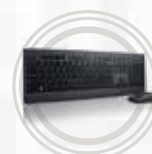
Lenovo Professional Wireless Keyboard & Mouse Combo