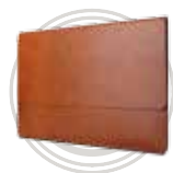
Yoga 920 Leather Sleeve