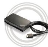
ThinkPad® OneLink+ Dock