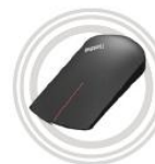
ThinkPad® X1 Wireless Touch Mouse