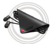
ThinkPad® X1 In-Ear Headphones