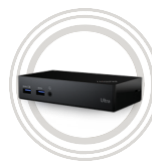
ThinkPad® USB 3.0 Ultra Dock Universal Docking Solution