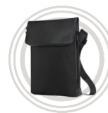
ThinkPad® UltraMessenger Function, Protection & Comfort