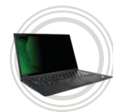
3M Privacy Filters from Lenovo™ Privacy Protection & Anti-Glare