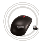
ThinkPad® Optical Wireless Mouse Mouse for All