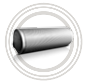
Lenovo™ 500 2.0 Bluetooth® Speaker

* Example of Lenovo™ Yoga™ catalogue naming convention